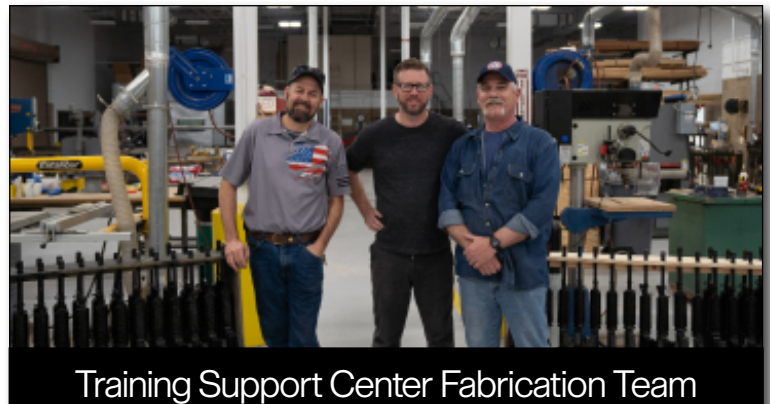
Training Support Center Fabrication Team

The Training Support Center's fabrication team has exemplified professionalism and pride in the work they perform whether that be the decor in the Fort Knox Visitor Center waiting area, the new Child Development Center project sign or the development of a new tank round created from blueprints, produced and shipped world wide. The team's ingenuity in getting the most out of each resource, while still providing professional quality products has saved thousands of dollars.