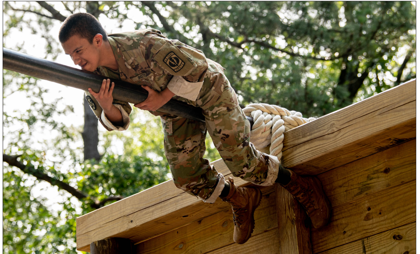
A Junior ROTC cadet from Barnwell High School in Barnwell, S.C. clings to one of the many obstacles on the Confidence Course during the Junior ROTC Cadet Leadership Challenge, June 5. Cadets from across South Carolina attended the six-day leadership challenge.

Beginning Monday morning and continuing through Thursday evening, students participate in a variety of activities seen by typical trainees at Fort Jackson such as the Confidence Course and the Teamwork Development Course. More unique activities are also sprinkled throughout their week at Fort Jackson such as archery, canoeing and Science,