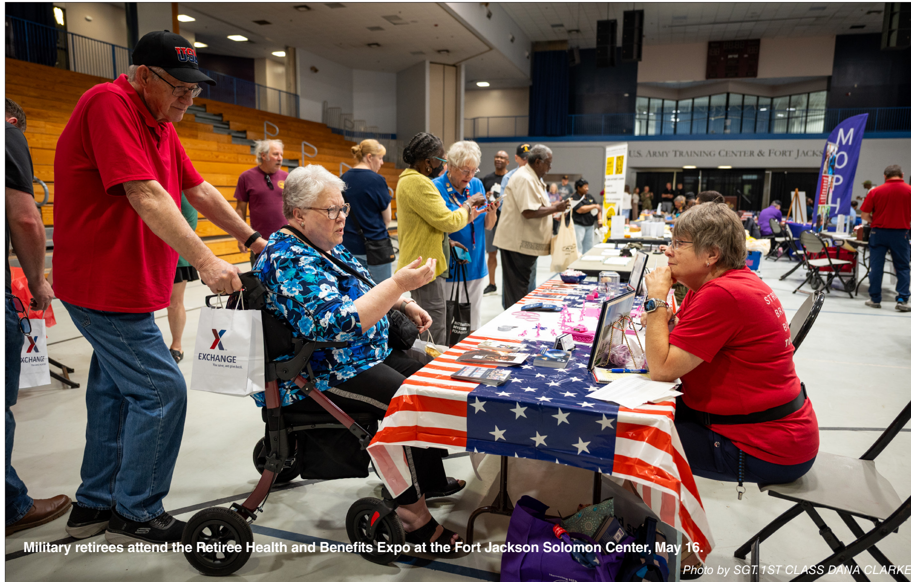
Military retirees attend the Retiree Health and Benefits Expo at the Fort Jackson Solomon Center, May 16.