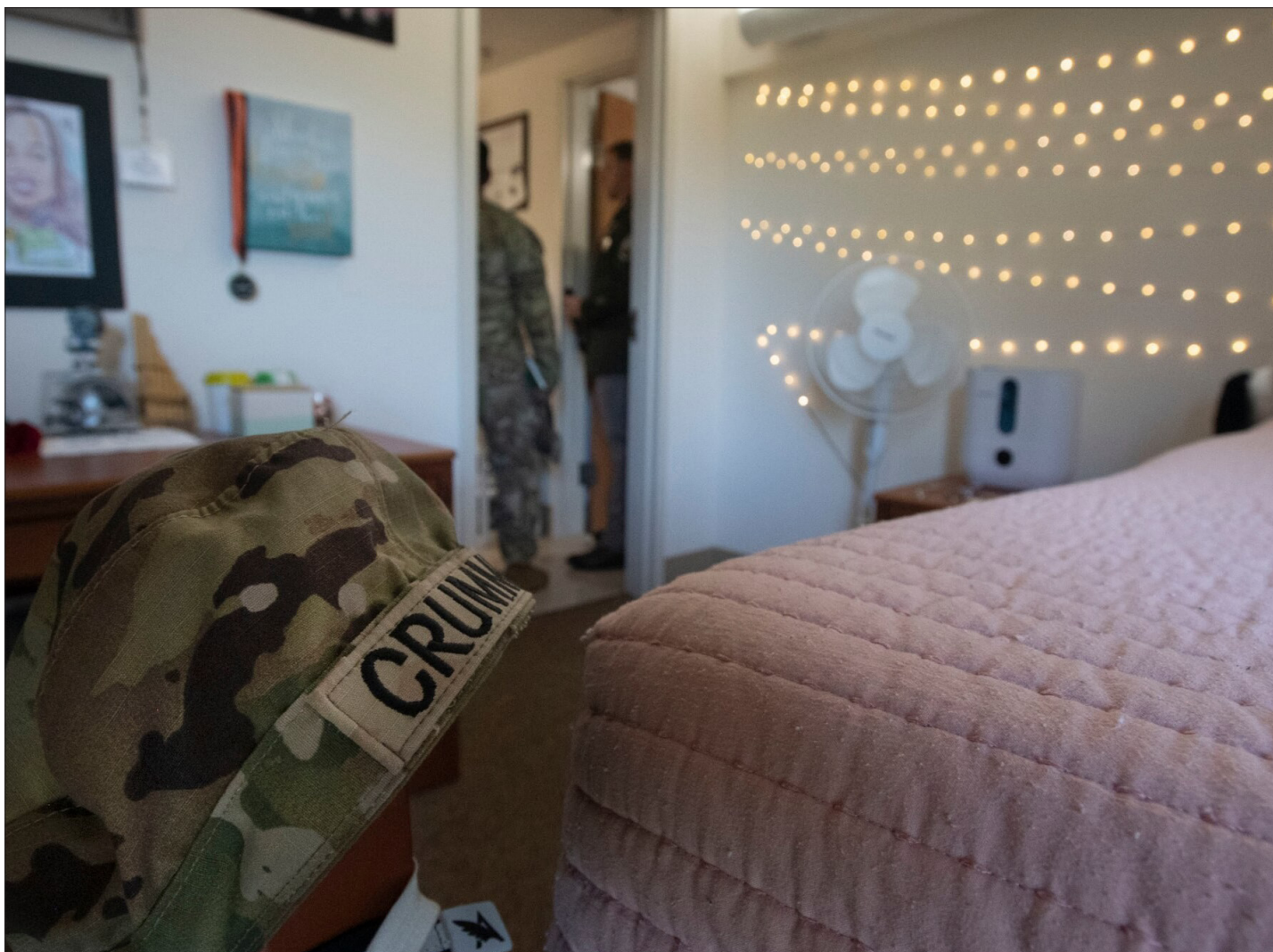
Leader file photo

The game featured plenty of high-light-reel action. There were booming kicks that sent the ball deep into the outfield, forcing defenders to chase it down, and quick sprints around the bases that had fans on the edge of their seats. Defensively, both teams made impressive stops—snagging line drives, making clutch catches, and tagging runners out in close plays at the bases. A few “bang-bang” plays at home plate sparked playful debate, adding to the competitive atmosphere. And of course, the crowd favorite moments came when staff members showed unexpected athleticism—proving they could still go all out and make game-changing plays when it counted.