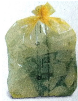
Transparent plastic bag