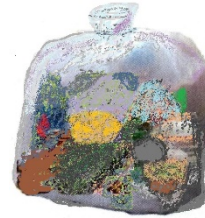
Transparent plastic bag