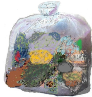
Transparent plastic bag