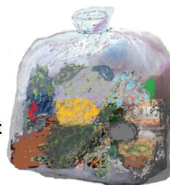
Transparent plastic bag

All the items, once cleaned and washed, have to be collected in transparent plastic bags only , and put on the public street, nearby your dwelling unit, the evening before the day of pickup ( No Yellow bag ).