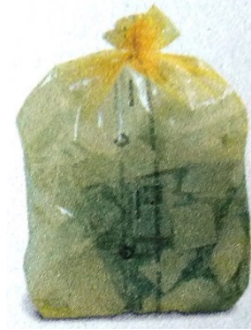
Transparent plastic bag