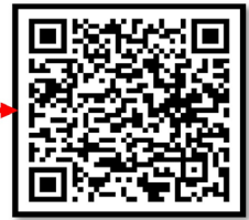
CFMO Driving Directions - Google Maps