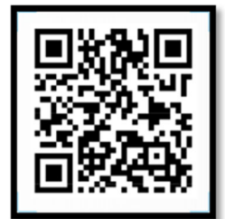
QR Housing Division

United States Army Garrison Italy Housing Division