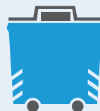
Roadside recycling bank