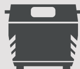
Roadside recycling bank