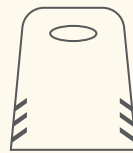
Roadside recycling bank

The collection system differs depending on the residential area. Depending on space and road layout, there are white or yellow recycling banks and yellow wheelie bins in the historic centre of the town. Furthermore, a door-to-door collection is provided in the monument area of the historic centre and some external areas according to a set calendar.