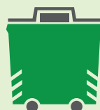
Roadside wheelie bin