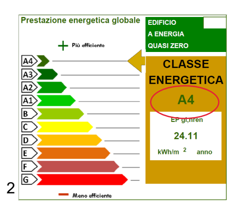
Rating is A4