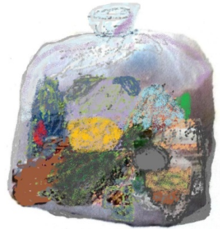
Transparent plastic bag