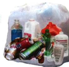
Transparent plastic bag

All the items, once cleaned and washed, must be collected in TRANSPARENT OR SEMI-TRANSPARENT PLASTIC BAGS (about 80 lbs) to be put on the public street, nearby your dwelling unit, the evening before the day of pickup. Squeeze and reduce bottles.