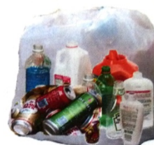
Transparent plastic bag

All the items, once cleaned and washed, must be put in transparent plastic bags that will be placed on the public street, nearby your dwelling unit, the evening before the day of pickup. Squeeze and reduce bottles. - Pick up is every two weeks on THURSDAY for the first two months, but from March it will be every two weeks on FRIDAY - (See SCHEDULE)