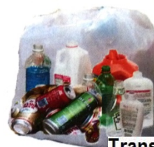
Transparent plastic bag

All the items, once cleaned and washed, must be put in transparent plastic bags that will be placed on the public street, nearby your dwelling unit, the evening before the day of pickup. Squeeze and reduce bottles. - Pick up is every two weeks on THURSDAY for the first two months, but from March it will be every two weeks on FRIDAY - (See SCHEDULE )