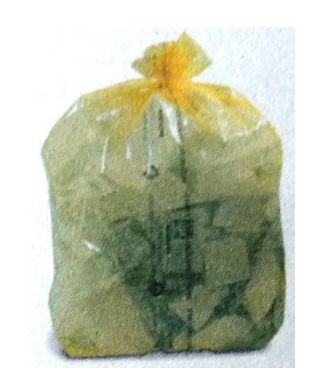
Transparent plastic bag