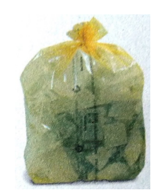
Transparent plastic bag