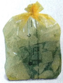
Transparent plastic bag