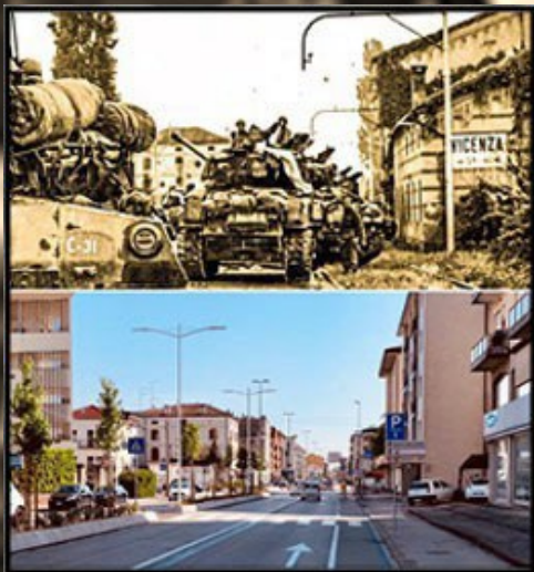
Viale Verona (Strada Regionale 11)