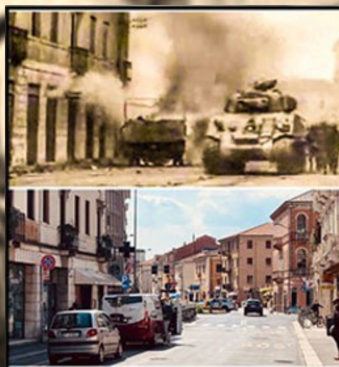
Corso SS. Felice e Fortunato