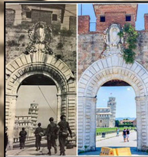
Porta Santa Maria Pisa