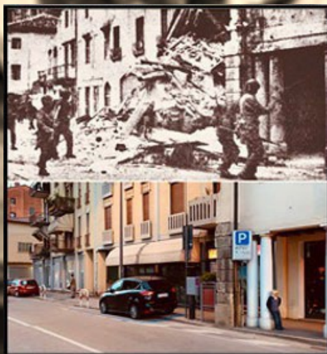
Viale Verona (Strada Regionale 11)