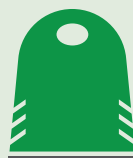
Roadside recycling bank

The collection system differs depending on the residential area. Depending on space and road layout, there are green recycling banks, or green wheelie bins in the historic centre of the town.