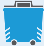
Roadside recycling bank