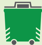
Roadside wheelie bin