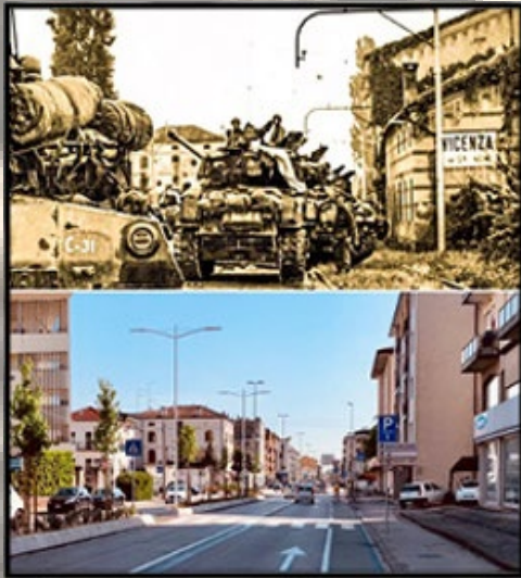
Viale Verona (Strada Regionale 11)