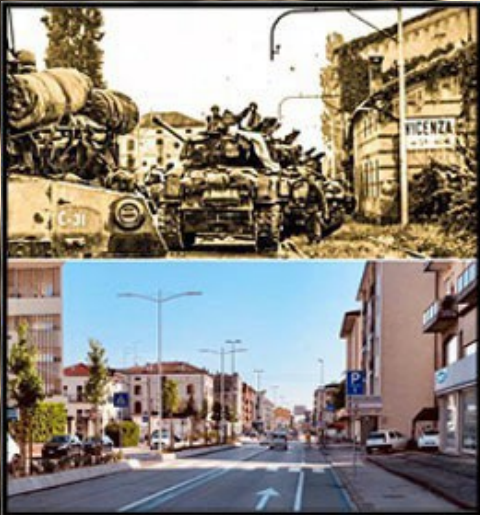
Viale Verona (Strada Regionale 11)