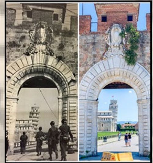
Porta Santa Maria Pisa