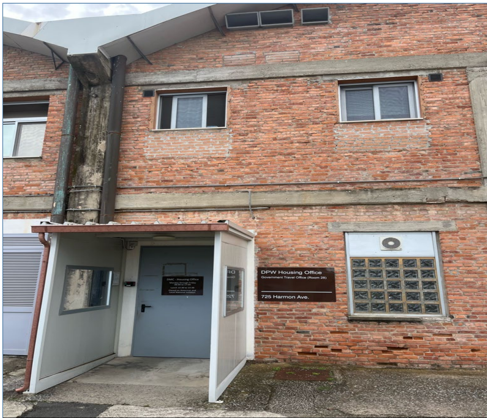
Located on Camp Darby bldg. 725