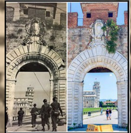
Porta Santa Maria Pisa