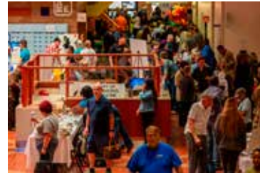
Retiree Appreciation Day at JBSA

More than 7,000 retired members and families attended the JBSA event, which is the largest conducted at any military installation worldwide this year.