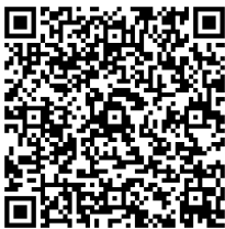
Fort Cavazos ESD/BSEP website

usarmy.cavazos.id-readiness.mbx.dhr-esd-bsep@army.mil