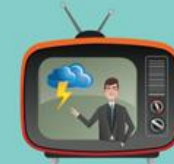
Local TV and Radio