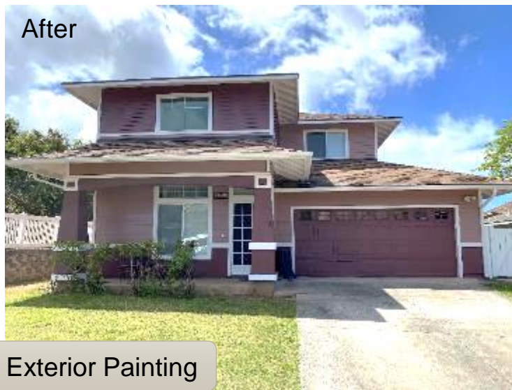
Simpson Wisser Exterior Painting