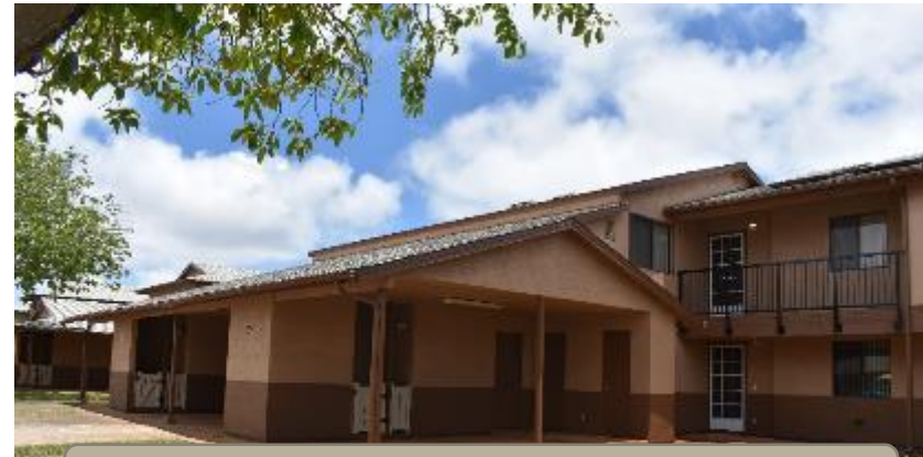
HMR Apartment to Town Home Conversion