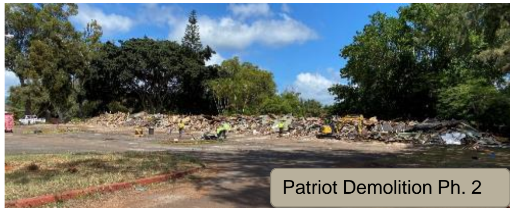
Patriot Demolition Ph. 2