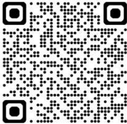
Smart Voucher Website