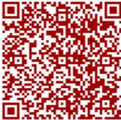
Desmond Doss Health Clinic Tour