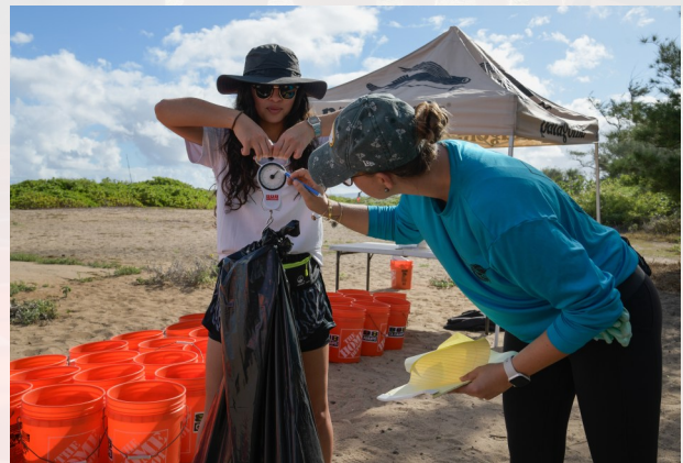
Environmental Division personnel with the United States Army Garrison (USAG) Hawai'i record bag weight for litter collected during the beach clean-up.

The U.S. Army in Hawai'i is deeply committed to working alongside local communities to protect and preserve the unique natural and cultural resources of the islands. Our efforts go beyond maintaining military readiness; they are about building strong partnerships that benefit both the environment and the people of Hawai'i. Events like the Mokulē'ia Beach clean-up are