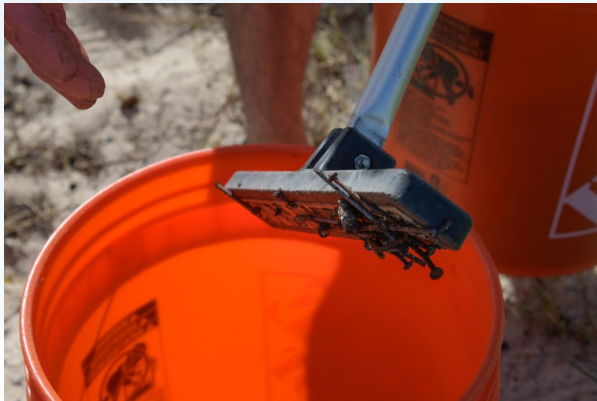
808CleanUps provided tools for collecting litter, including long-handled magnets to remove hundreds of nails left in the sand after illegal bon-fires.

The coastal area around Mokulē'ia is home to endangered species such as green sea turtles and native yellow-faced bees, which rely on the beach's natural vegetation for nesting and