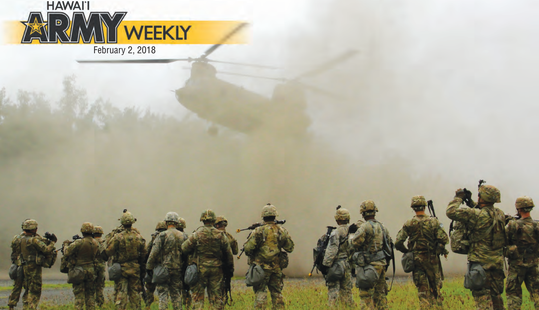
Combat Engineers from Alpha Company, 29th BEB, 3rd BCT, 25th ID, wait in formation before loading onto a CH-47 Chinook.