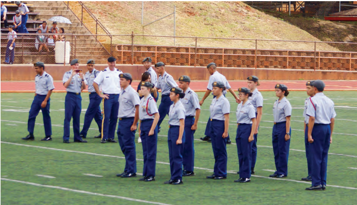
Members of the Mililani High School Army JROTC Program perform a drill routine during the 2018 West Point Society Drill Meet, Jan. 27.