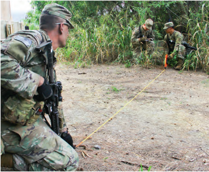
Combat Engineers from Alpha Company, 29th BEB, 3rd BCT, 25th ID, measure the width of a road as part of a route reconnaissance.

The company conducted the training extremely light when compared to a normal FTX for a combat engineer company – only packing individual equip-