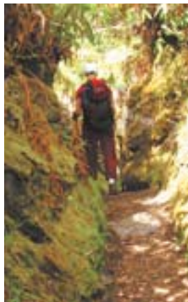
A lone hiker momentarily hides from the sun along a tropical rainforest trail around Kilauea.

quality. For that reason, park rangers are constantly checking the levels of sulfur dioxide in and around the crater.