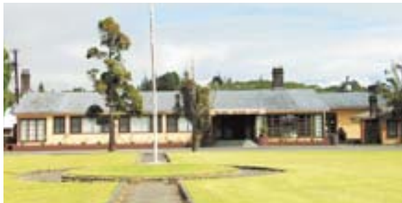
The Kilauea Military Camp lodge, within the Hawaii Volcanoes National Park, sits at an elevation of 4,000 feet above sea level. The camp occupies 56 acres of the 300,000 plus acres of the park.

In the past 25 years, there have been only two full-scale evacuations of the site due to volcanic eruptions, according to Mardie Lane, a park ranger and public affairs officer for the Hawaii Volcanoes National Park. The more frequent danger, she added, has to do with day-to-day air