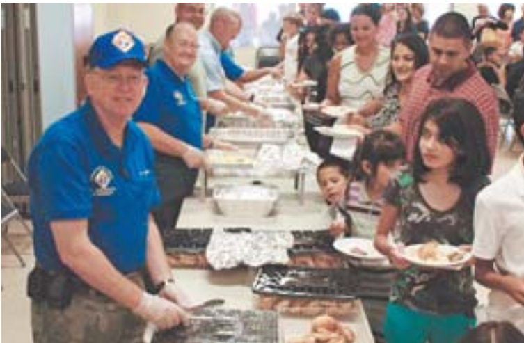
Members of the Knights of Columbus serve breakfast to the crowd after Mass during the 4th Annual Soldier Appreciation Breakfast, at the Schofield Barracks Main Post Chapel Annex, Sunday.

“It’s nice to come home and feel welcomed by