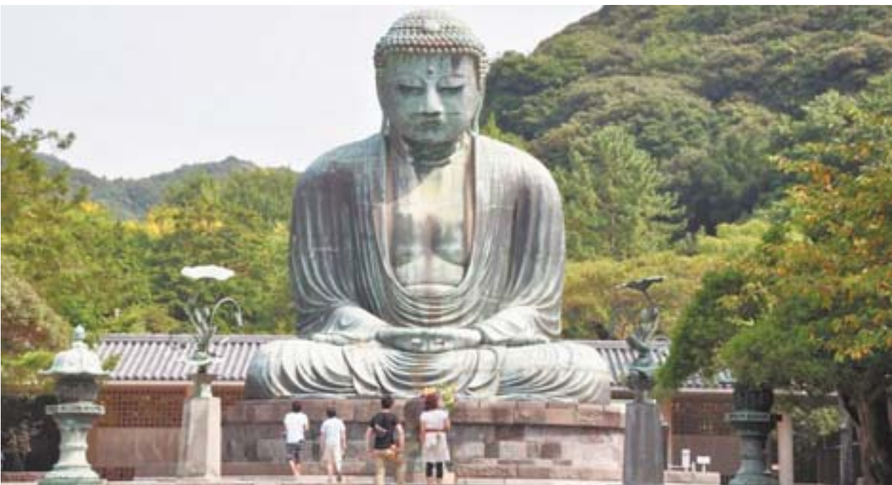
The Daibutsu, or "Giant Buddha," looms large above tourists at the Kotokuin Temple, near Kamakura, Japan.