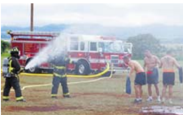
Firefighters from the Oahu Consolidated Federal Fire Department hose down exercise victims who may have possible chemical contamination during the U.S. Army Garrison-Hawaii Annual Antiterrorism Exercise.

"This was stellar," she said. "Everyone came together, and we had some fun. We keep on learning, keep on training, to do the right thing for the public."