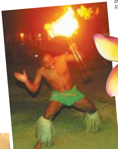
A fire dancer stokes the flames and the excitement of guests during the Piliilau Army Recreation Center luau, Aug. 14.