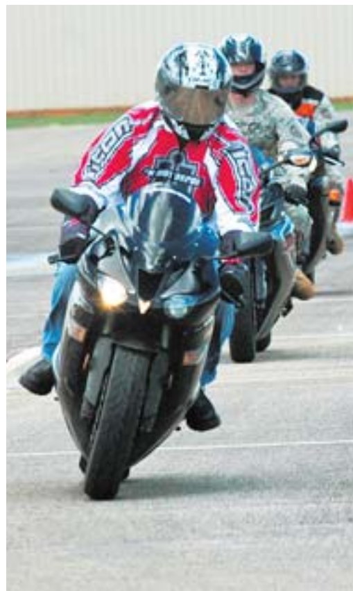
Service members prepare to maneuver a curve on a course designed to build their confidence in turn techniques during the first-ever U.S. Army Garrison-Hawaii sponsored advanced motorcycle safety course at Wheeler Army Airfield, Aug. 18.