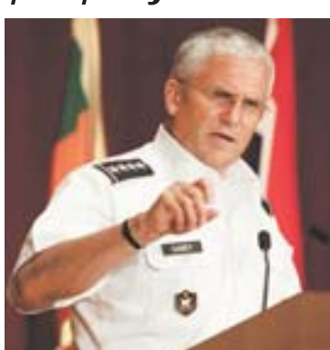
Gen. George W. Casey Jr., Chief of Staff of the Army, speaks during the opening ceremony of the 6th Pacific Armies Chiefs Conference in Tokyo, Aug. 24. The conference is designed to foster military-to-military cooperation and develop interpersonal relationships that contribute to regional stability.

The delegates from each country are meeting daily to discuss a variety of topics dealing with