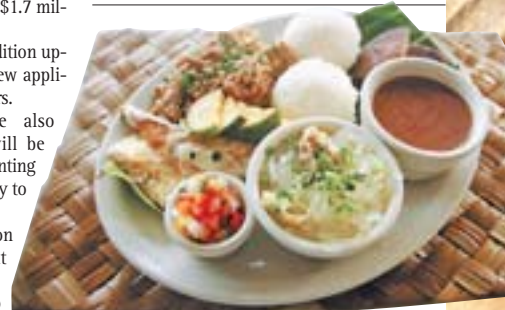
A traditional Hawaiian luau meal including Kalua pork, lomi salmon, poi and rice are served buffet-style during the Piliilau Army Recreation Center luau.

Adults cost $17.95; children (5-12 years old) $10.95, 5 and under are free. Parties of four or more should call to reserve seating at 696-4778.