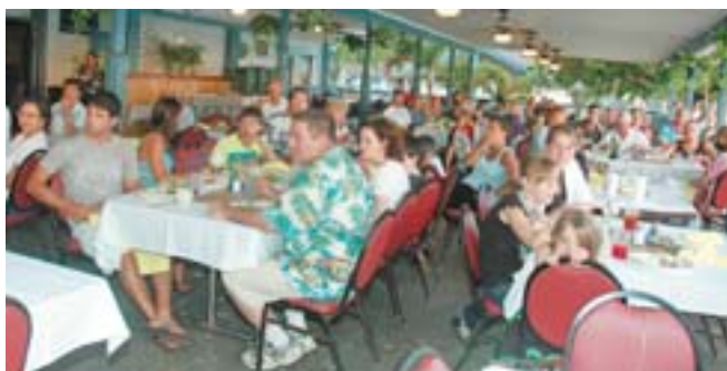
Guests seated on the lanai at the Sunset Café at Piliilau Army Recreation Center (PARC) are drawn into the music and dancing during the luau. The bimonthly event attracts military families islandwide.

Day trips to PARC offer some of the most pristine beaches in the islands, with