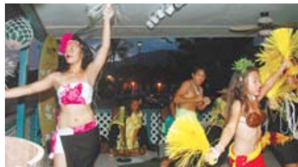
Dancers from the group "Keiki O Mokiau," an extended family of performers, take the audience on a tour of Polynesian culture through hula, Tahitian and Maori style dance during the luau at Piliilau Army Recreation Center at Pokai Bay, Aug. 14.