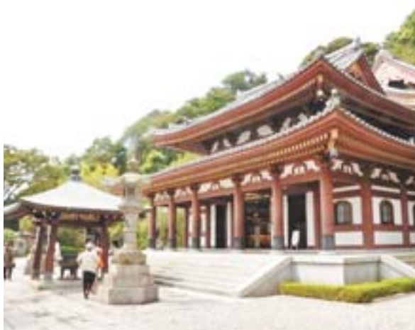
An ancient temple commands attention near the Tsurugaoka Hachimangu Shrine, Kamakura, Japan.

8th TSC Soldiers will wrap up their training exercise this weekend and return to Fort Shafter, Hawaii.