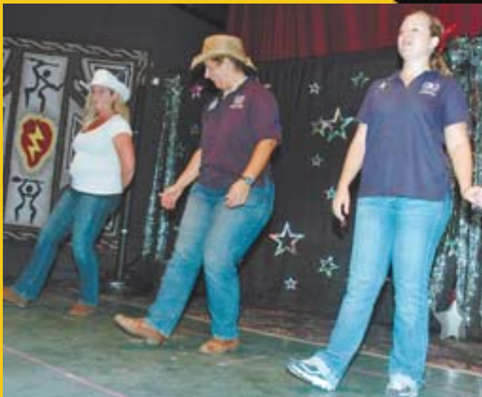
With a "wild west" attitude, line dancers take the stage to perform a number during the Family and Morale, Welfare and Recreation expo at the Tropics, Schofield Barracks, Friday.