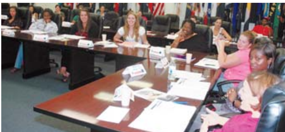
More than 20 Army spouses enjoy a lighthearted moment during the "Welcome to the Jungle" Level I Army Family Team Building (AFTB) class at the Noncommissioned Officer (NCO) Academy, Aug. 4.