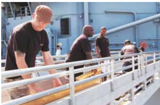
Soldiers from the 40th Quarter Master Company, 45th Special Troops Battalion, 45th Sustainment Brigade, assist in cleanup efforts on the U.S.S. Missouri, July 14, in Pearl Harbor.

"As a nonprofit organization, we rely on volunteers. When Soldiers come in to