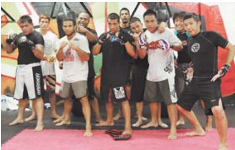
(Above) The dedicated Mixed Martial Arts team takes a break from training to pose for a picture at the Oahu Central school in Wahiawa.

"Being a Soldier and being a fighter are a little