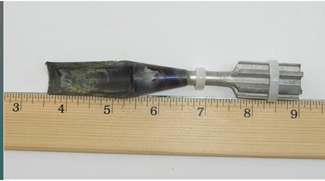
M101 spotting round fragment

Army and DOD regulations now prohibit the use of munitions that contain DU in training.