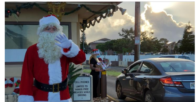
HMR Holiday Breakfast-to-Go

https://www.facebook.com/islandpalmcommunities