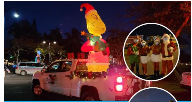
Home for the Holidays – Santa Parades