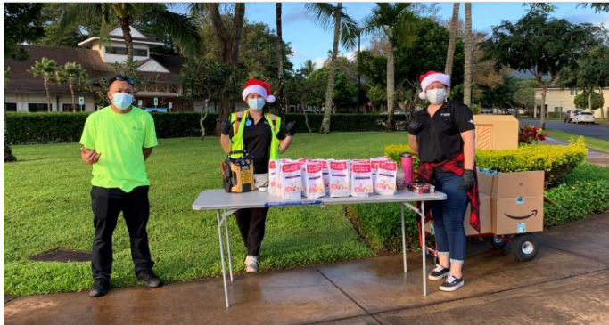
Kaena Snack Bag Give-Away