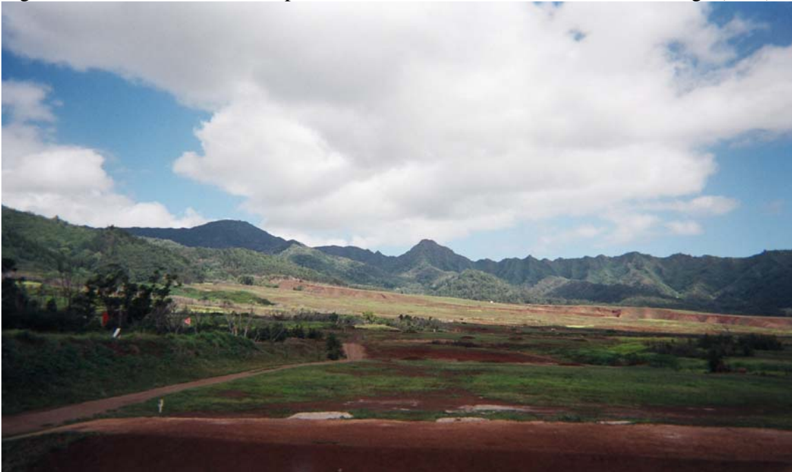
Figure 4. Schofield Barracks Impact Area toward the Wai'anae Mountain Range (west)

The prevailing winds are northeasterly trade winds from 4 to 12 mph in the warmer summer months and lighter southeasterly winds in the winter months (US Army 2008a). The soils on the training site are silty clay originally created from basalt flow and alluvial sediments from the Wai'anae Volcano to the west and the Ko'olau Volcano to the east (US Army 2008b, 2008c). Soils that appear grey or black are rich in magnesium oxide. Soils that appear reddish are richer in iron oxide (Figures 4 and 5).