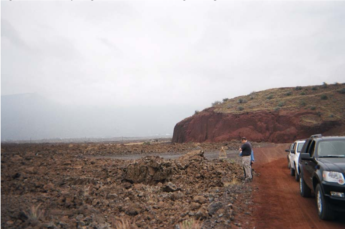
Figure 11. Firing/impact range at Pohakuloa Training Area (view to the south from one puu toward another puu)