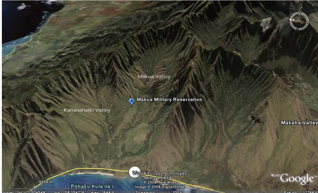
Figure 6. Makua Military Reservation, Northeast Corner of the Island of Oahu

The reservation covers 4,856 acres (globalsecurity 2008b). It has a beautiful shoreline and two valleys, the Makua and the Kahanahaiki that drain to the Wai'anae Coast (Lucking 2001). The Makua Valley has been used by the Army and other United States military forces as a training area since before World War II. Steep cliffs partially surround the impact area from the southwest to the north. The cliffs are too steep to be used for maneuvers. Several thickly wooded gullies cut through the impact area and the cliffs (Figure 7). The soils in this valley are similar to those found at Schofield Barracks. A forest reserve is to the north and to the south with the Waianae Mountain Range to the east (globalsecurity 2008b).