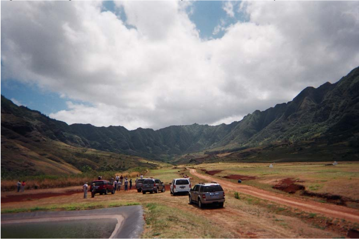
Figure 7. Looking to the east in Makua Valley on the Makua Military Reservation

The Army has been responsible for the site since 1943; however, the training area has also been used by the Marine Corps, Coast Guard, Air Force, the Army Reserve, and the Hawaii Army National Guard (Onyx 2001). Currently, for legal reasons, this site is not being used as an active training area. In the past, the Makua Valley has been subjected to air bombing, ship to shore firing, amphibious operations and live firing of infantry and artillery weapons leaving the reservation dotted with unexploded ordnance. Since 1950, there have been several clearing operations that included controlled burning of undergrowth and detonating unexploded ordnance, but the site is still known to have a variety of unexploded ordnance. In August 1998, five World War II-era bombs were discovered while surveying and mapping the site. These bombs were safely detonated. Later, 81 smaller pieces of unexploded ordnance were located and detonated (Lucking 2001). Although the use of the M101 spotting rounds has not been confirmed at Makua, it is possible that training on the Davy Crockett recoilless guns could have taken place at this site due to the size of the firing range.