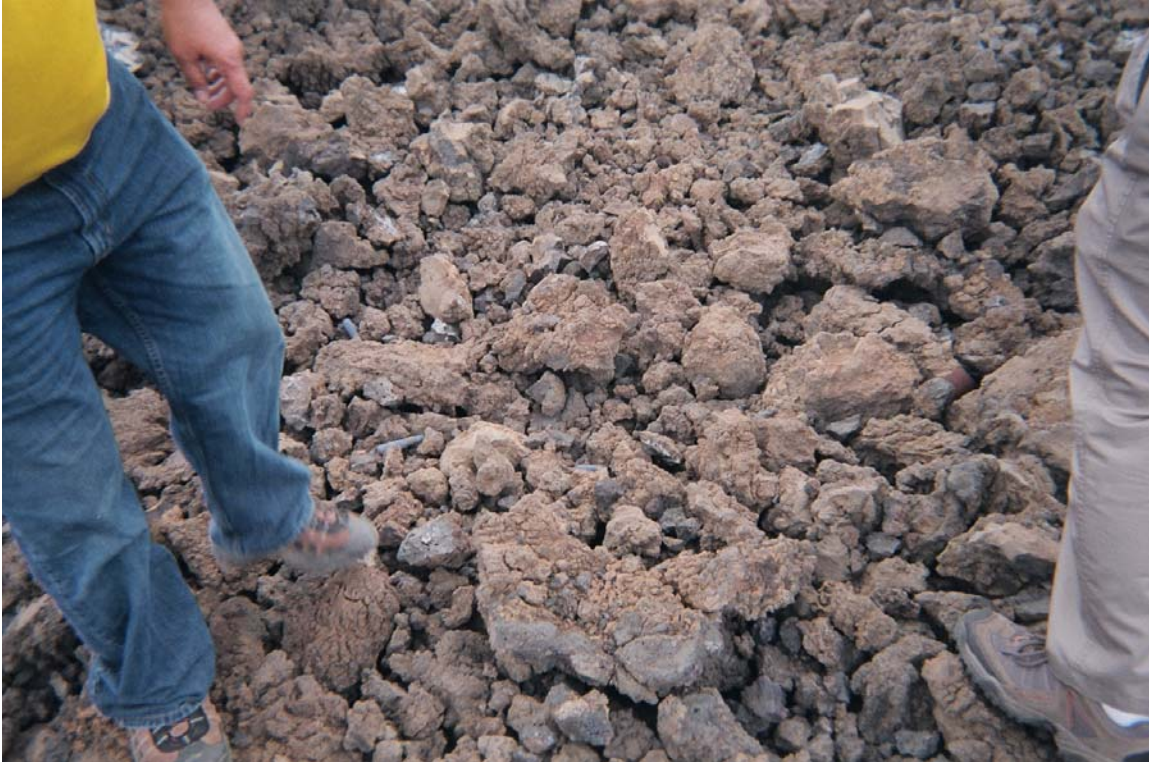
Figure 9. 'A'a (type of lava) on artillery range at Pohakuloa Training Area

The eastern portion of the training area is sparsely vegetated. The northern and western portions have the deepest soils and slightly more vegetation (Beavers 2000). Pohakuloa's 51,000-acre impact area located in the eastern portion is over ten times the size of the impact area at Schofield Barracks. It is surrounded on the north by several ranges and designated firing points for artillery (globalsecurity 2008c). Cinder cone hills (or puu's) dot the landscape and can be used for artillery practice (Figures 10 & 11).