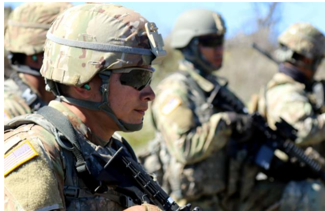
Hawaii Army National Guard Soldiers react to a simulated ambush during annual training at PTA. These Soldiers conduct combat operations training for several weeks during their annual training at PTA.