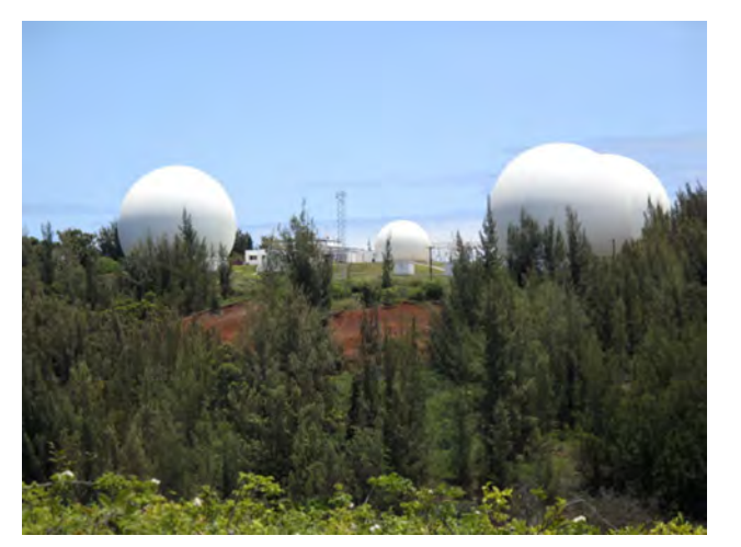
Today, a modern Navy telecommunication station occupies the top of the hill adjacent to the Opana Radar Site. Since the 1941 radar was a mobile unit, there is no physical evidence of it at the site.

On December 7, 1941, the Opana Radar Site was manned by two privates who detected the approach of a mass of aircraft at 7:02am while practicing with the radar equipment. The men reported their findings to the temporary information center at Fort Shafter. The lieutenant that received the report reasoned that the activity was a flight of Army B-17 bombers scheduled to arrive that morning from California and advised the radar crew not to worry. The privates at Opana continued to track the planes until 7:40 when contact was lost in the background interference as the planes approached O'ahu. Only after the men had secured their equipment and were headed back to their base did they realize the aircraft they had monitored were Japanese planes on their way to attack Pearl Harbor and other O'ahu military installations. The missed opportunity to correctly identify the incoming Japanese air attack is one of the great "what might have beens" of military history.