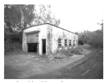
warhead building where missiles were assembled

Initially in Hawai'i, missiles were fired during service practice at remote controlled aircraft targets that were launched northeast of Kaua'i from aircraft. The Nike batteries in Hawai'i were the only sites other than Alaska that actually fired missiles in practice firings from their sites. During practice firings in 1962 and