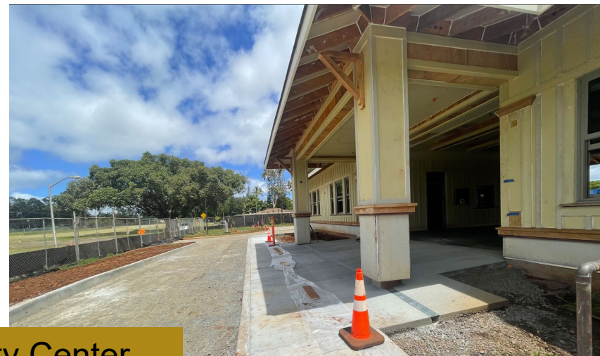
Canby Community Center