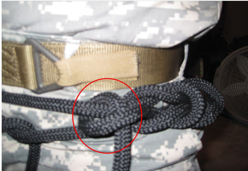
OVERHAND KNOT TIED TO WRONG ROPE (MINOR)