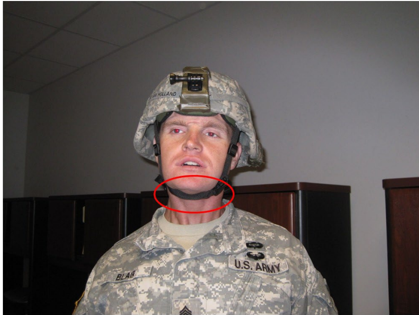
SQUARE KNOT IMPROPER (MAJOR)