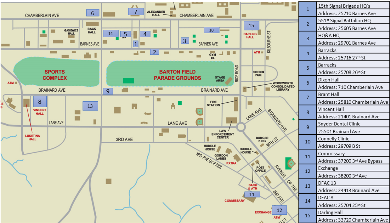
Figure 1.C- MOS-T Interest Map