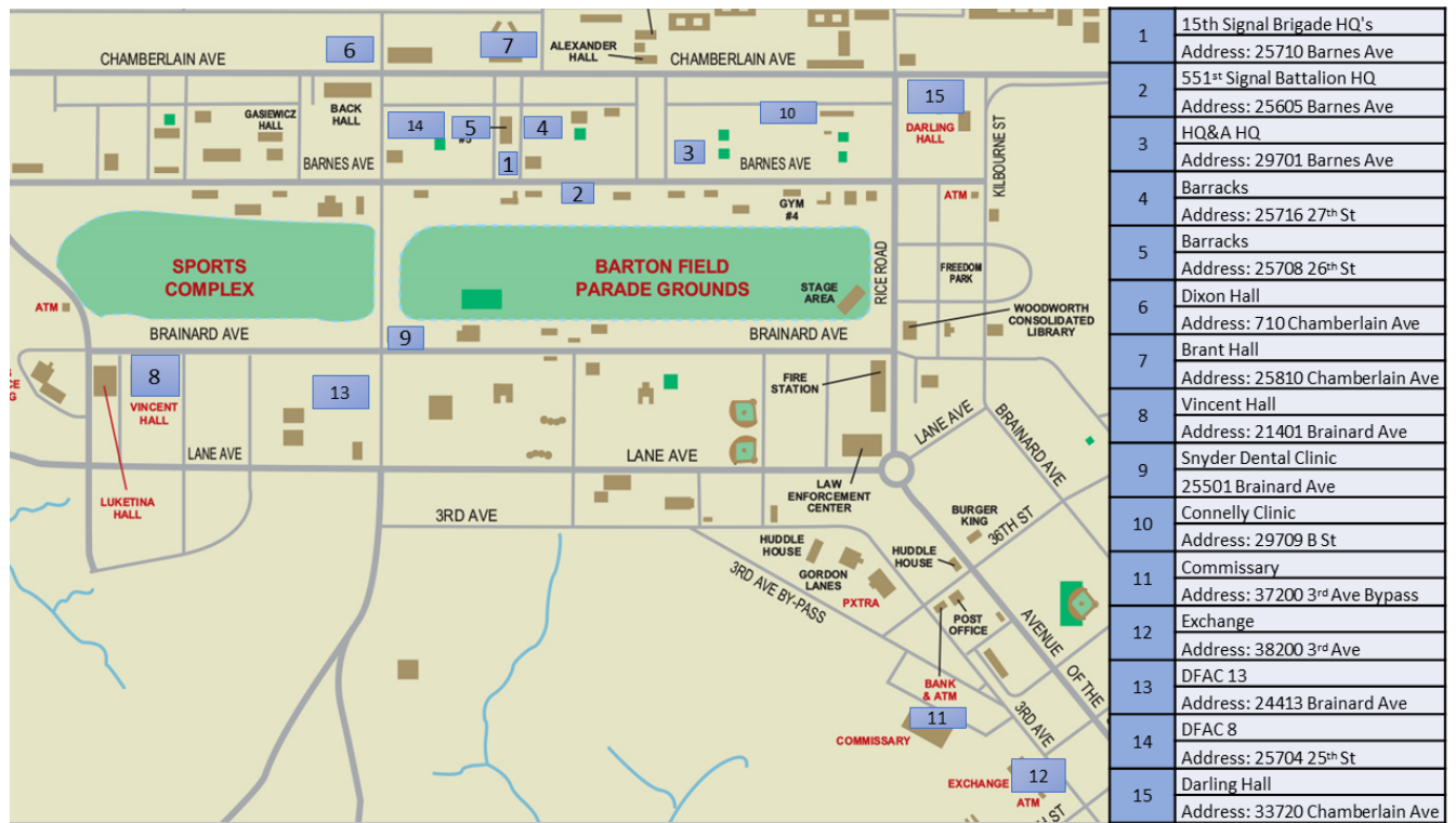
Figure 1.C- MOS-T Interest Map

SUBJECT: Welcome Letter for MOS-T Reclassing to 25B/25H