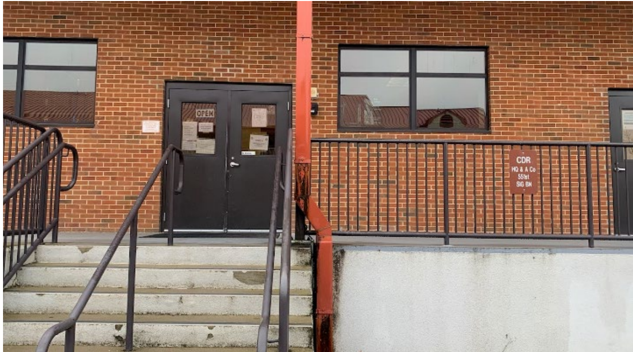
Figure 1.A- Company building – Rear entrance door

SUBJECT: Welcome Letter for MOS-T Reclassing to 25B/25H