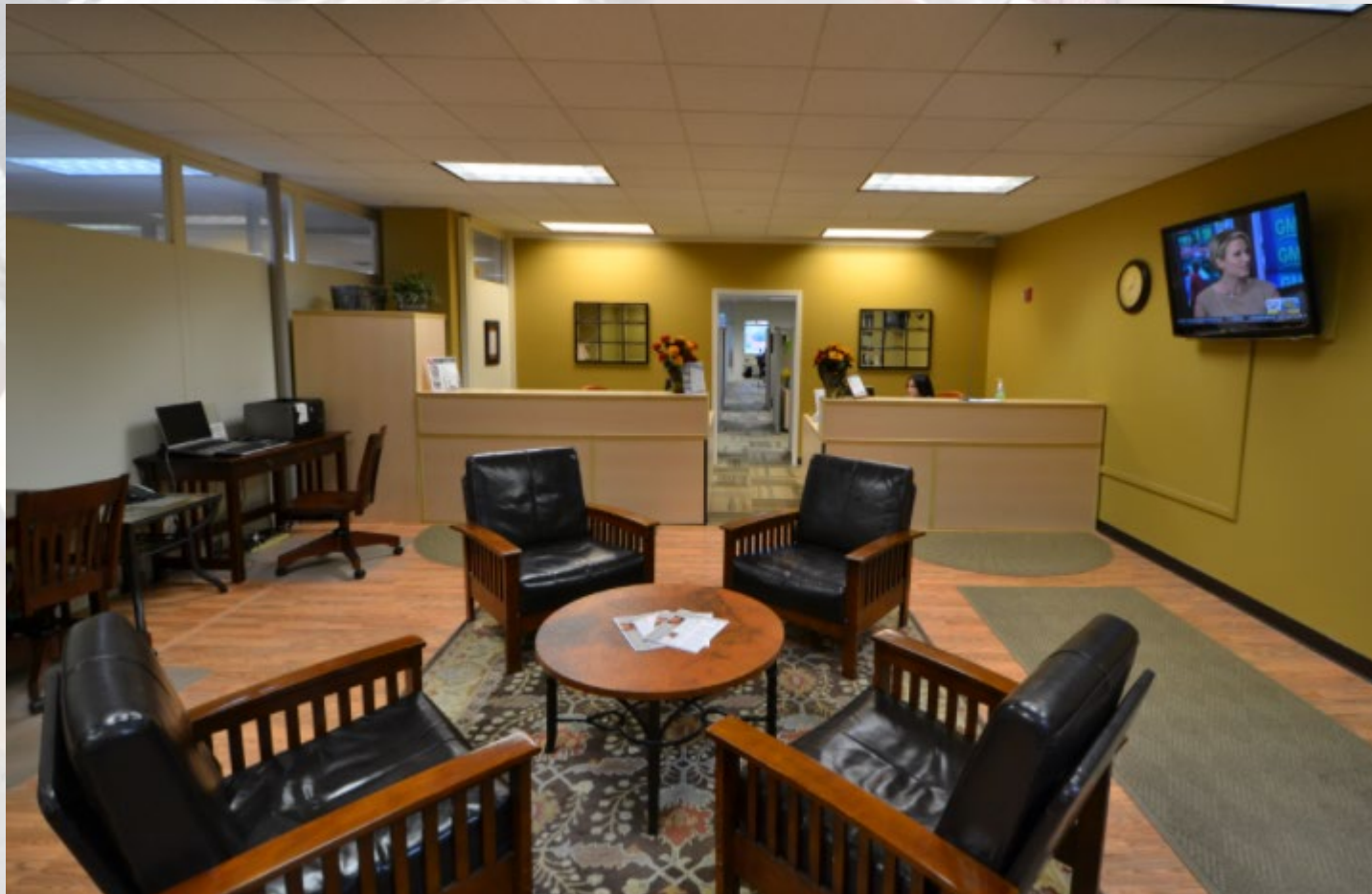
Solider for Life Center: 10870 Mt. Belvedere Blvd Rm. A2-54