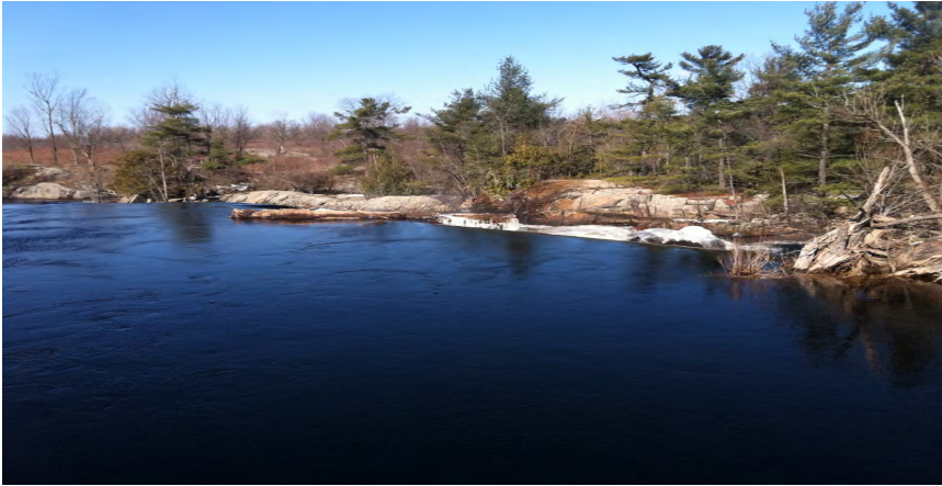
Indian River at Carr Road on Fort Drum.