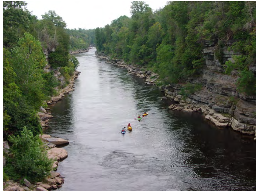
Kayakers on the Black River in Brownville, New York.

Fort Drum routinely tests for contaminants that may be present in source water to include: microbial contaminants, inorganic contaminants, pesticides and herbicides, organic chemical contaminants, and radioactive contaminants.