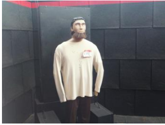
Human Urban Target

The Shoot House is equipped with 10 Human Urban Targets (HUTs). The HUT unit is equipped with mortal and non-mortal hit sensing capabilities, and visual response to a kill shot. Available options include adding motion detecting devices, Multiple Integrated Laser Engagement Systems (MILES) Shoot back capability, and MILES interface kill feature.