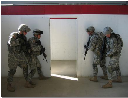
A four-man team prepares to enter the shoot house corridor.

The Fort Devens Automated Shoot House is a fully recorded facility that provides units with a place to train and evaluate individual Soldiers and squads on tasks necessary to move tactically, engage targets, conduct breaches, and practice target discrimination in a live-fire environment.