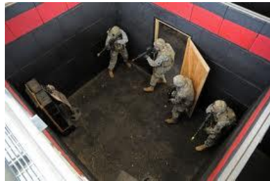
Soldiers practice room entries.