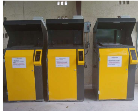
Towers Food Waste Containers