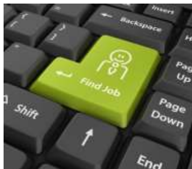
Job Search by appt (federal and private)