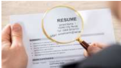
Resume Review by appt

USAJOBS Application assistance Account set-up Federal Resume help