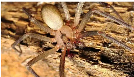
Brown Recluse Spider