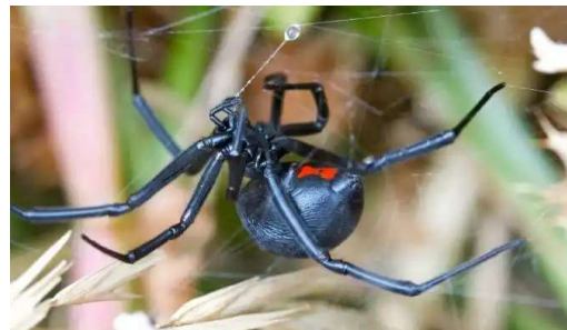
Black Widow Spider