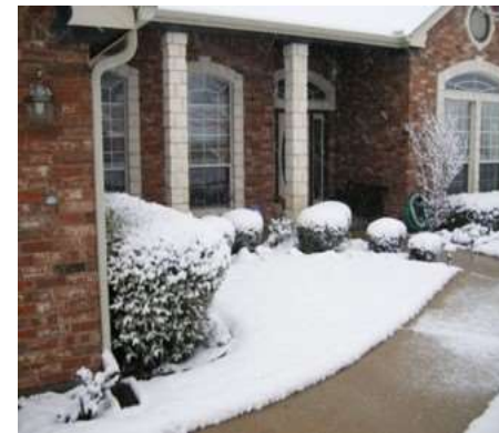
YES, IT DOES SNOW HERE!

***RAIN IS THE LEADING CAUSE OF ACCIDENTS IN 39 OF 50 STATES***