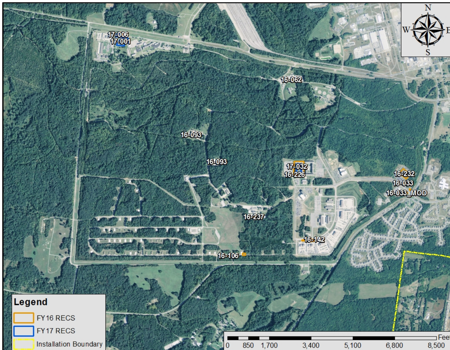
Figure 2. REC Project Areas