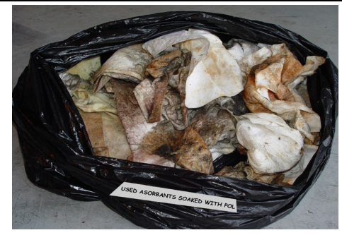
Please note: Absorbent bag is labeled

NOTE: If absorbent pads/paper towels/rags are contaminated with POL and are NOT DRIPPING with oil, they may be disposed of in dumpster. Otherwise label and place items in the return locker for removal by the hazmat driver. All grease contaminated materials must be bagged for disposal.