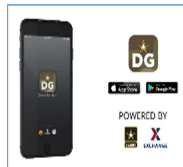
Digital Garrison (DG) App Powered by U.S. Army & Exchange