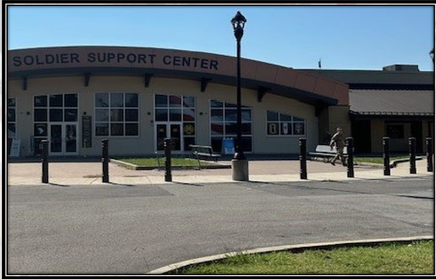
Fort Campbell Soldier Support Center